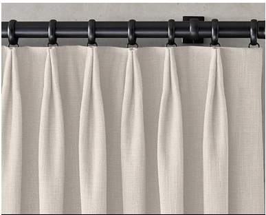
DOUBLE FRENCH PLEAT