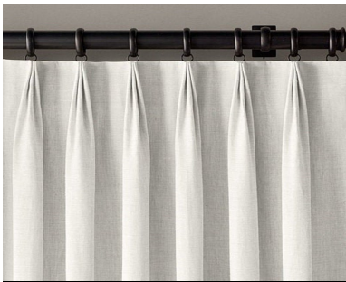
TRIPLE FRENCH PLEAT