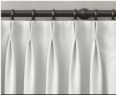
DOUBLE PINCH PLEAT