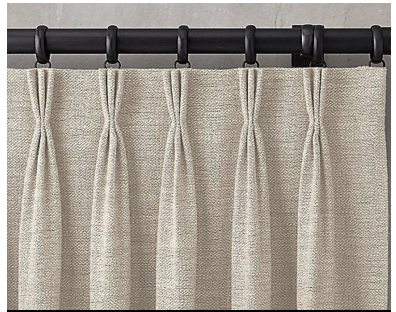
TRIPLE PINCH PLEAT