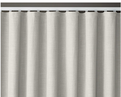
RIPPLE FOLD (WAVE)