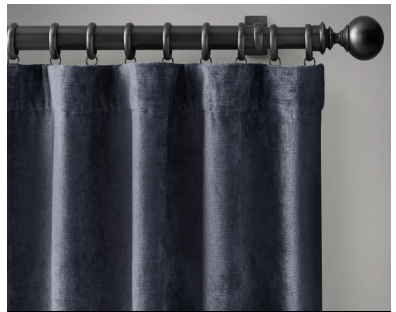
DOUBLE RING PANEL