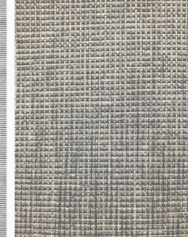
Decorative Valance: Fabric wrapped hard

Fabric wrapped hard cornice outside mounted at ceiling with appropriate hardware to safely and securely mount to the site conditions. Valance to extend over sides of roller shades.