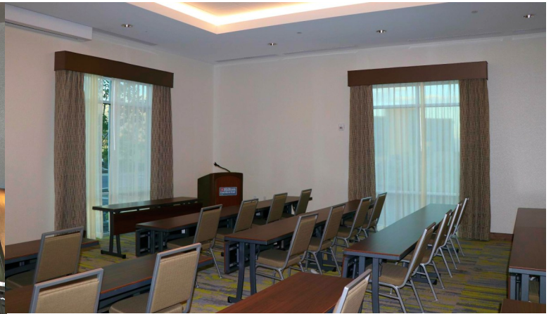
Lobbies and Meeting Rooms